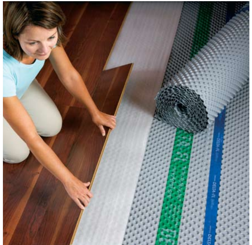
Laminate can be placed directly on DELTA®-FL.

*seams are sealed with DELTA®-MOISTURE PROOF TAPE.