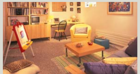
Typical carpet installation.