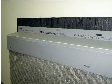
DELTA@-DRAIN PROFILE EDGE TERMINATION SECTION