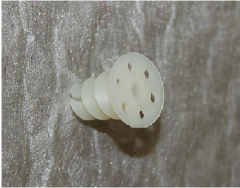
DELTA@-SCREW FASTENER FASTENING ANCHOR