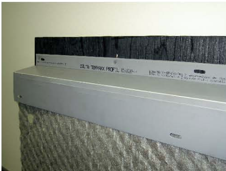
DELTA@-DRAIN PROFILE EDGE TERMINATION SECTION